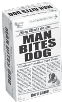
Man Bites Dog™ Card Game

See our entire line of games and puzzles at: