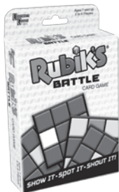
Rubik's® Battle Card Game